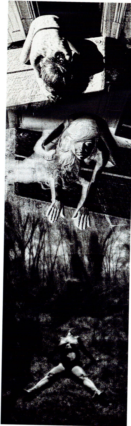
Body Cartograph , panels 3&4 photographic digital composite and text printed on silk gauze, 16"x120"

so one must marvel at the symmetry or hide behind a salt p- illar & crumble / to be inside together i- s to be inside a tom- b the irrevocable d- ark belly of a whale