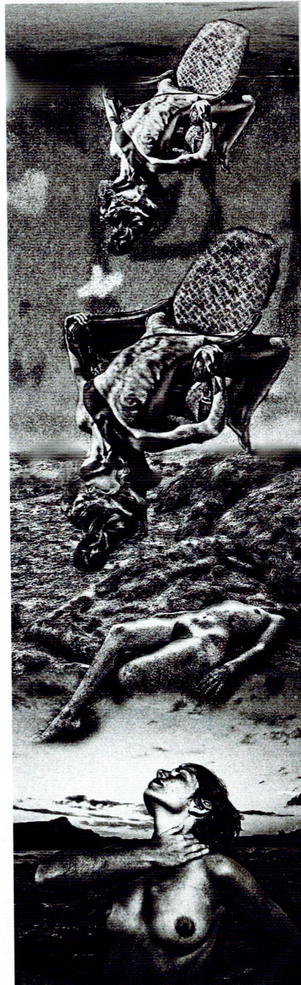
Body Cartograph , panels 7&8 photographic digital composite and text printed on silk guaze, 16"x120"

the body isn't repetition nor is it inert it returns returns to the city of earth / body is a tender stone / body is a terrible memento rep- licating since the body isn't repetition nor is it inert it returns returns to the city of earth / body is a tender stone / body is a terrible memento rep- licating since the body isn't repetition nor is it inert it returns returns to the city of earth / body is a tender stone / body is a terrible memento rep- licating since